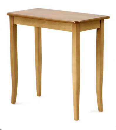
High Cabrio Leg Side Table

Standard veneer top with rounded profile